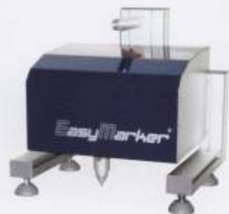
EasyMarker EM 100 portable.

Functions equal to standard model EasyMarker EM 100, but easy for transport and applicable on larger objects at your premises. Easy operation: place EasyMarker on your part and press the start button in the handle. Data input will immediately be retrieved.